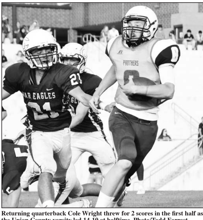
the Union County varsity led 14-10 at halftime.

A quarterback scramble went for nearly 40 yards when the Chestatee pass protection broke down and it appeared that Union County defensive end Kyle Williams had a bead on War Eagle veteran quarterback Storm Yarborough. Instead, the rising-senior QB was able to step up in the pocket to avoid Williams, then break free into